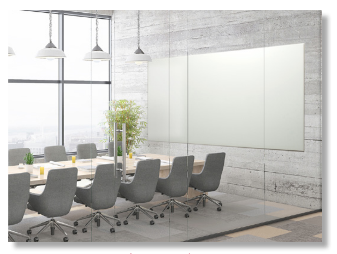
Satin Non-Glare Frameless Glass Marker Boards